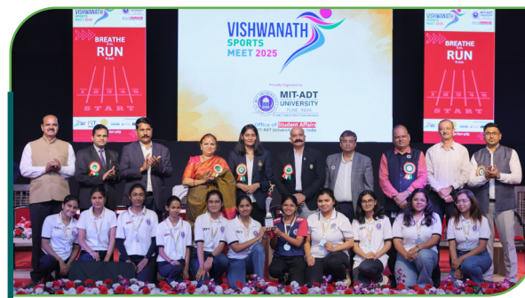
Vishwanath Sports Meet