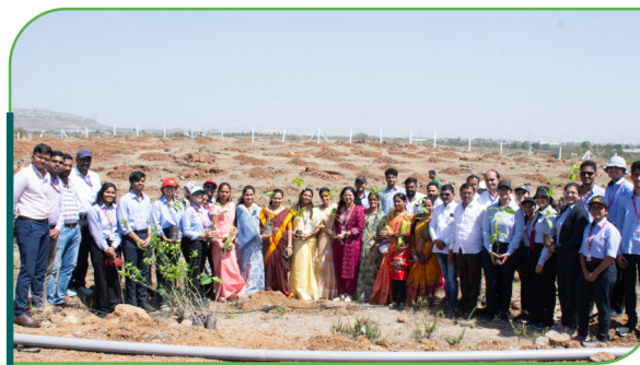
Village Adoption Program