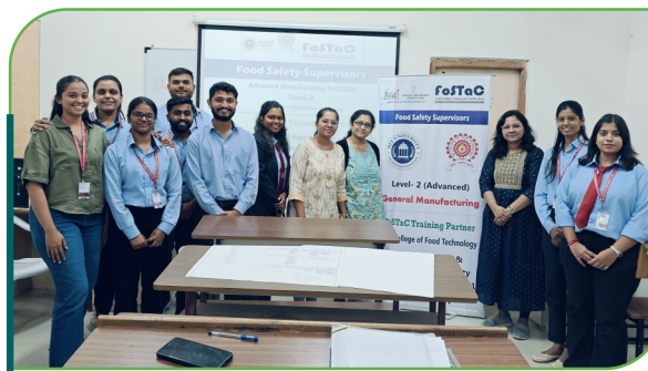
FSSAI FoSTaC Training