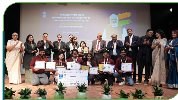
Smart India Hackathon, 2024