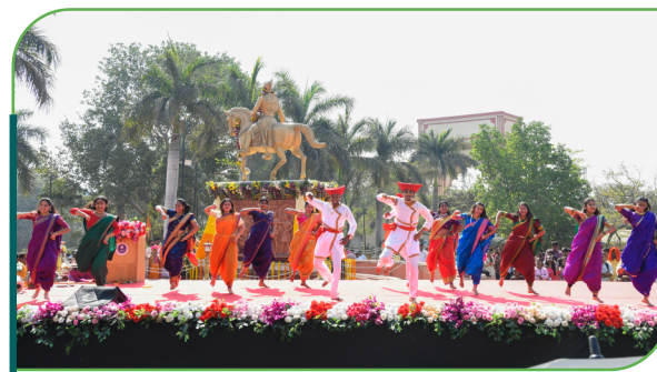
Chhatrapati Shivaji Maharaj Jayanti